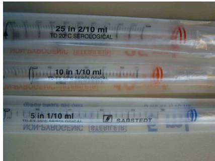
Sterile Serological Pipette