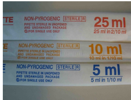
The same from their back