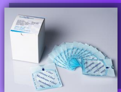
MCE Gridded Membrane