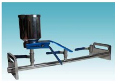
MS® Serials Vacuum Manifolds