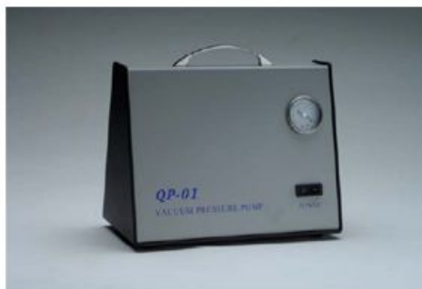
MS® Vacuum Pump